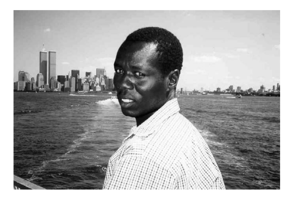
Filming The Lost Boys

somebody shows them how to flush a toilet, some of their job interviews and conversations with the charity workers who are supposed to be helping them, are funny – but in a way that makes you laugh at the Americans, so well meaning, so unable to understand or communicate with the young Africans they are trying to help. The film could be read as a series of humiliations for the boys.